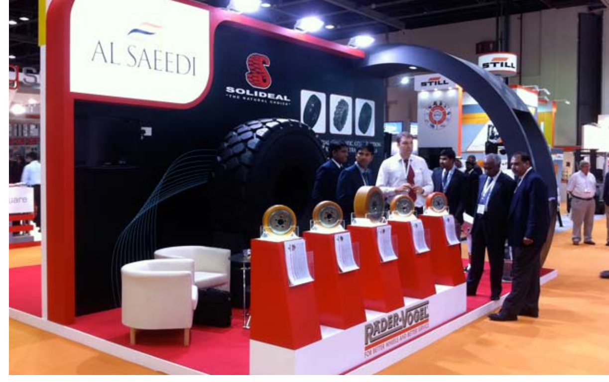
Al Saeedi is a prominent exhibitor of all trade shows in UAE

Our sale channels such as our existing clients, our dealers and our own retail counters make sure our imported brands get a good market share among the other competitor brands prevailing in the market.