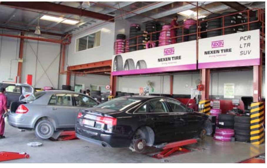
Service Facility for Cars and Trucks in Al Saeedi DIP

companies that look after the UAE market. The city office is based in the upcoming industrial area, Dubai Investments Park.